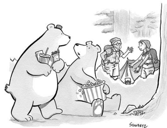
"You missed the part where she asks why he even agreed to go camping if he was just going to complain the whole time."

The sky was blurry because there were tears in my eyes; and I went to bed, so proud, so blessed to be the Pastor of Saint Mary's Parish. Ihr seid alle schön!